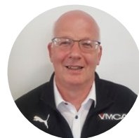
Chief Executive Officer YMCA Fylde Coast

I would like to congratulate and thank all of our board members, partners, staff and volunteers for their commitment. Each person has contributed to our achievements in some way and crucially helped to keep us moving forward on our journey towards fulfilling our vision and mission.